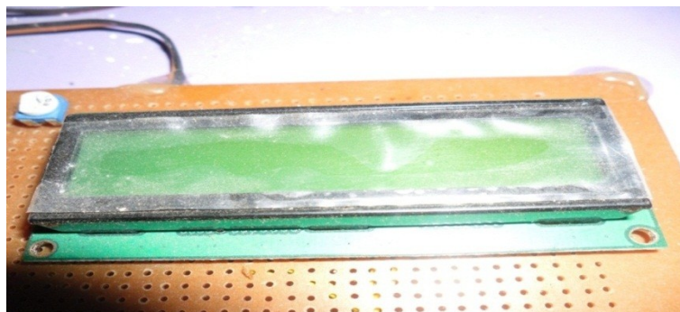
Figure 4.3: Temperature Display

The temperature display is important part of thermal conductivity measurement apparatus. Its work to display the temperature of two different sections on display screen. The temperature of first section display first and temperature of other section display last.