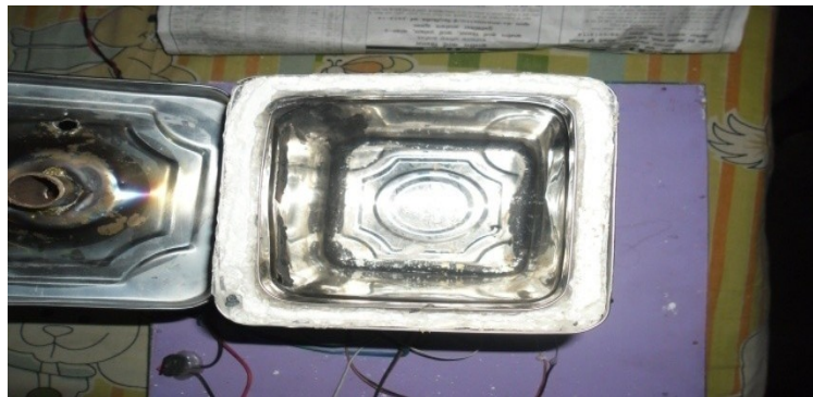
Figure 4.2: Water Tank

The purpose of water tank was the measurement of heat loss from the metal rod. The water tank is surrounded by the thermocol material (TM) which reduces the heat loss from water to the surrounding atmosphere.