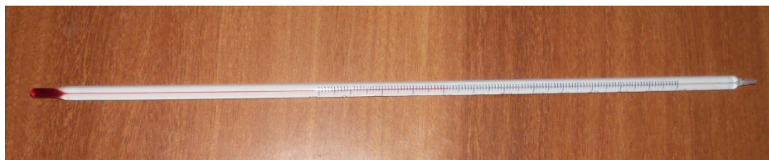
Figure 4.4: Thermometer

Mercury Laboratory Thermometer was used to measure the temperature of water heated during experiment until to achieve steady state condition. The mercury Laboratory thermometer had range of -10^{\circ}\text{C} to 110^{\circ}\text{C} to measure the temperature of water.