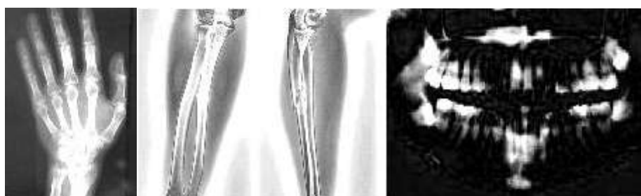
Figure.5 Enhanced image with DWT