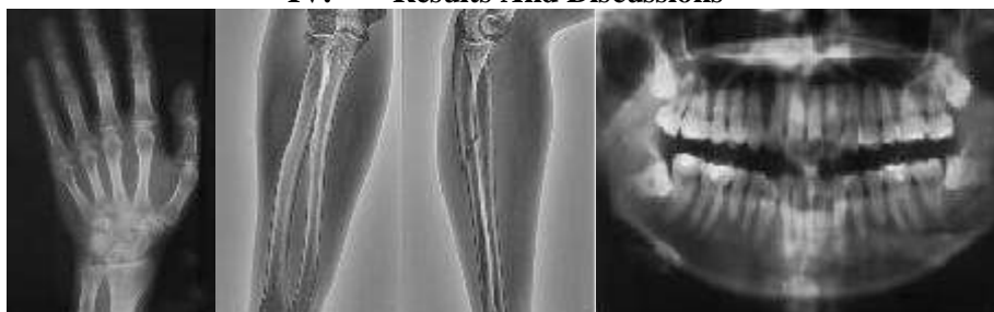
Figure.3 original image