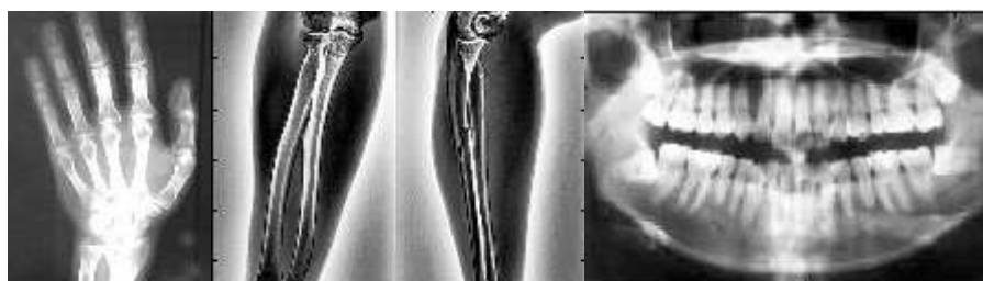
Figure.6 Enhanced image with preprocessed histogram equalization