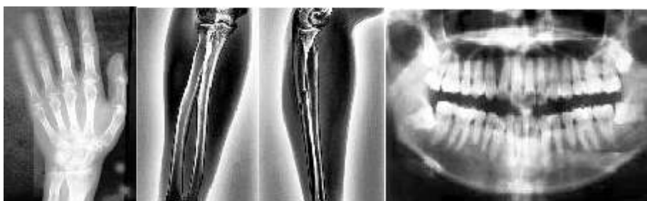
Figure.4 Enhanced image with histogram equalization