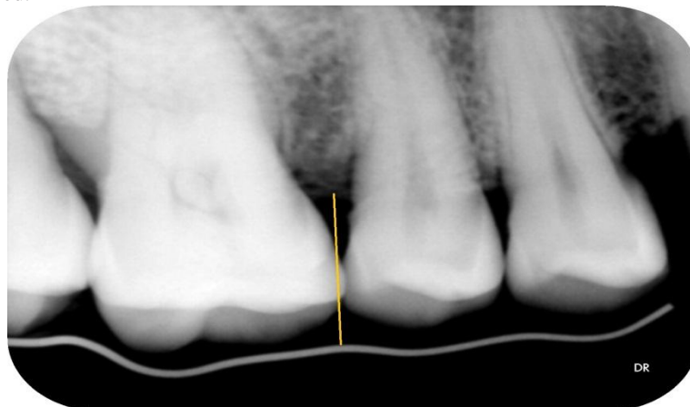
Figure 2 – Bone Level assessment by Radio Visuo Graph (RBL)