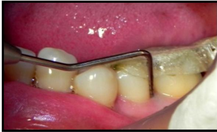
Figure 1a – Bone level assessment by Trans Gingival Bone Probing (TGP)- Probe is penetrated vertically until resistance is felt.