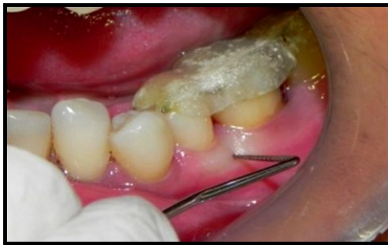
Figure 1b– Bone level assessment by Trans Gingival Bone Probing (TGP)- Probe is penetrated horizontally and bleeding point marked.