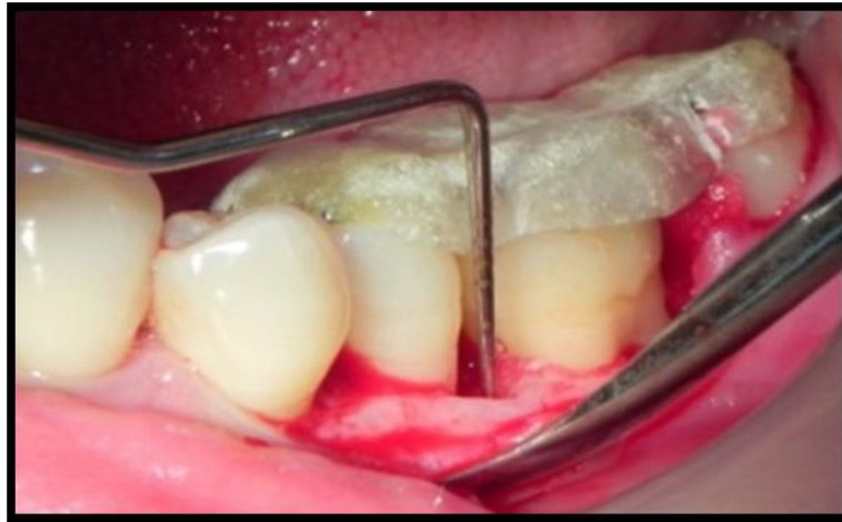
Figure 3 – Bone level assessment by Surgical Flap Elevation (SBL)