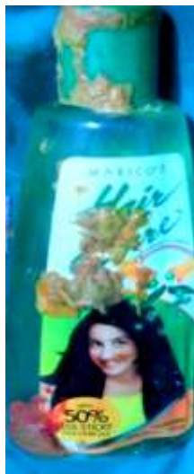
Fig. 2. Extracted FB