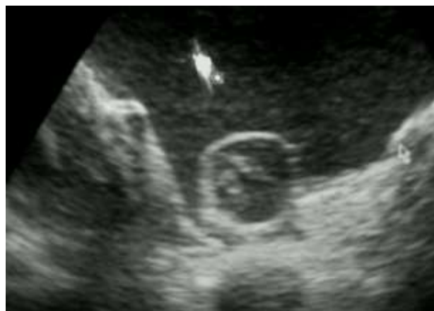
Figure 2 Zoomed image of the hypoechoic mass showing two nodules within.