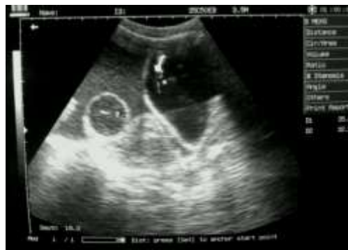
Figure1. Transabdominal ultrasound scan of the pelvic region (longitudinal), showing the oval-shaped hypoechoic mass surrounded by massive ascites with internal echoes.

The patient had only transabdominal US with a 3.5MHz curvilinear transducer at the first presentation. This was unable to detect the omental endometriotic nodules and the adhesions were not clearly resolved. The right ovarian cyst and massive ascites were however well outlined. The abdominal CT carried done at the second presentation was valuable, detecting the ascites and a right adnexal fullness with normal abdominopelvic organs, blood vessels and lymphatic channels. Abdominal CT is of value in omental anatomy and it would have detected the omental nodules if it was done prior to the first surgery. Though the US feature of pelvic adhesion is a fixed retroverted uterus, this was not observed in our patient but she rather had a right adnexal fullness which correlated with the CT findings. Though TVS and RES are superior to TAS and abdominal CT for deep endometriosis, they wouldn't have been able to detect the omental nodules or clearly delineate the adhesion. In the index patient, abdominal MRI would have been the appropriate modality to detect all the lesions and accompanying adhesions.