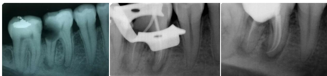
Figure 1: Pre operative radiograph Figure 2: Master cone radiograph Figure 3: Post obturation radiograph