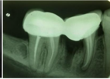
Figure 4: Extracted distal root Figure 5: Radiograph after hemisection ceramic bridge cementation Figure 6: Radiograph after metal