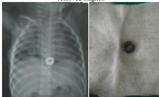
Figure 4: Xray Neck/chest and abdomen A/P view showing stainless steel Nut in the lower esophagus along with the removed Nut.