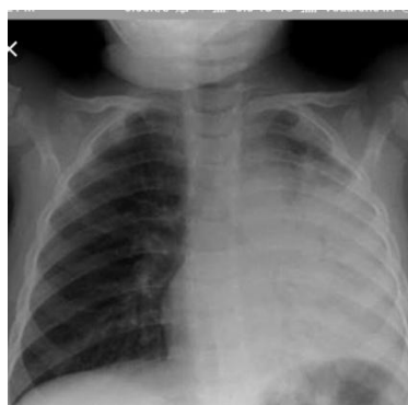
Figure 6 : Xray chest P/A view showing left middle and lower lobe atelectasis due to impacted groundnut in the left bronchus.