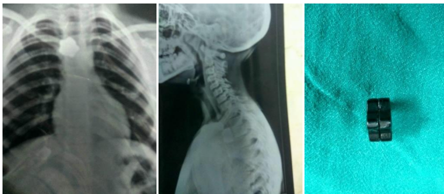
Figure 3: Xray Neck and chest A/P and lateral view showing magnet in upper esophagus along with the removed magnet.