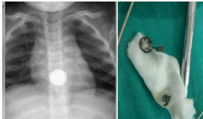
Figure 2 : Xray chest A/P view showing alkaline battery cell in mid oesophagus along with removed foreign body.