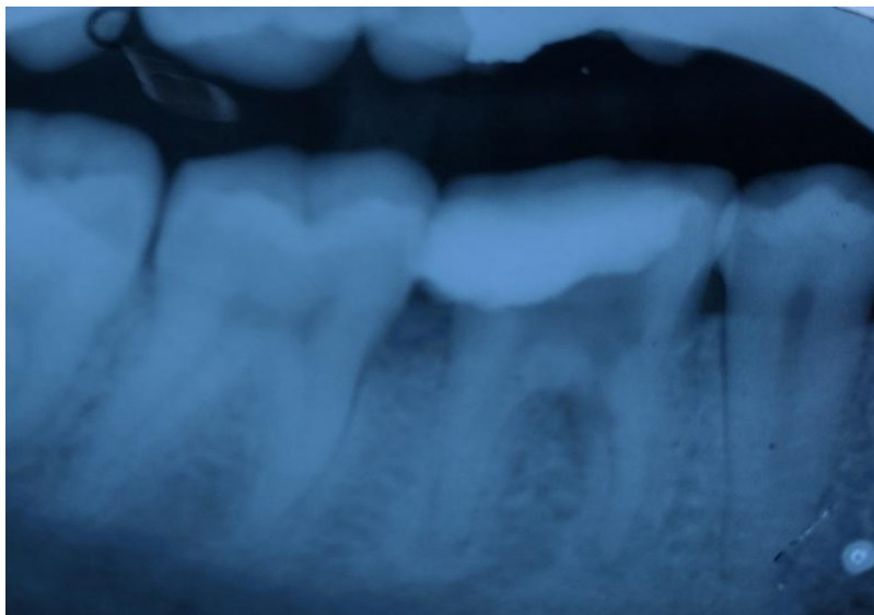
(Figure 1: Pre-operative radiograph)