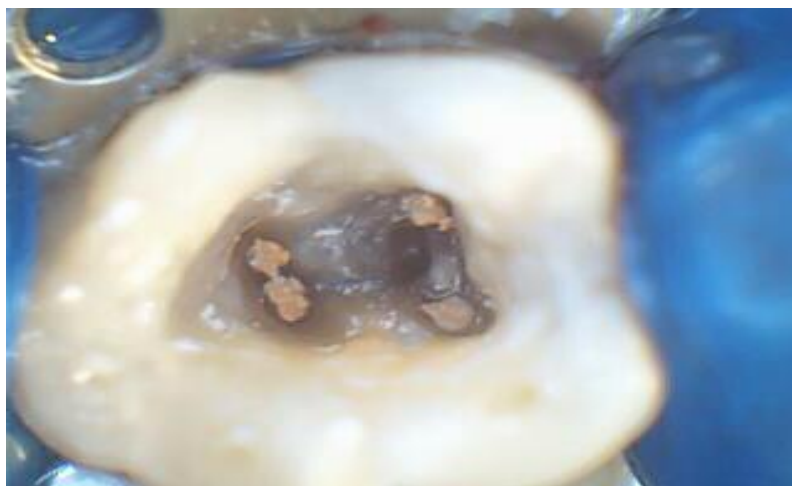
(Figure 4: Obturation of canals)