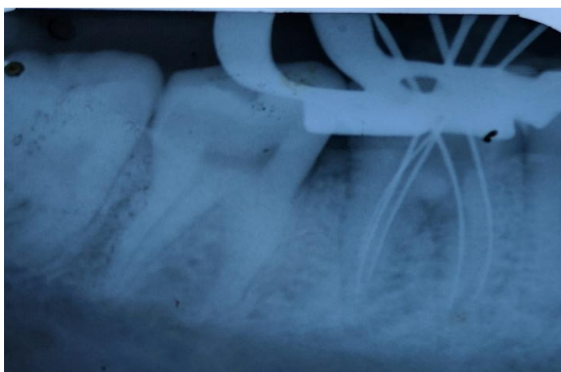
(Figure 3: Working length radiograph)