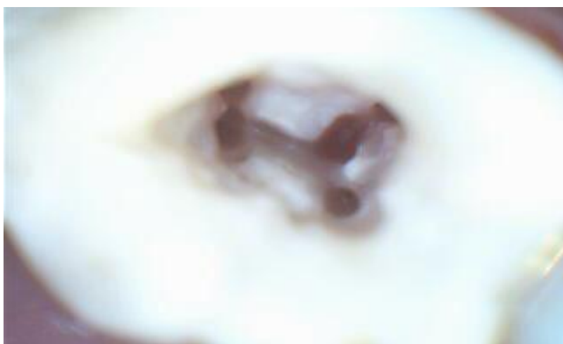
(Figure 2: Access cavity preparation)