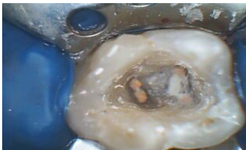
(Figure 5: Perforation repair with MTA)