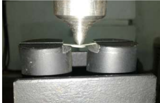
Figure 2. Three point bending test on universal testing machine

Bond strength was calculated with formula of \tau = kxF_{fail} , where \tau is bond strength, reported in Megapascals (MPa). K is a constant, which is a function of the thickness of the metal sample and its modulus of elasticity. Bond strength value of six groups was analyzed by one-way ANOVA, t-test, and Kruskal Wallis test. Normal distribution data was tested by Shapiro-Wilk test. Homogeneity of variance was tested by Levene's test.