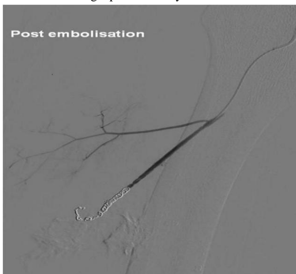
Fig 3: Successful embolisation of the PFA branch pseudoaneurysm.