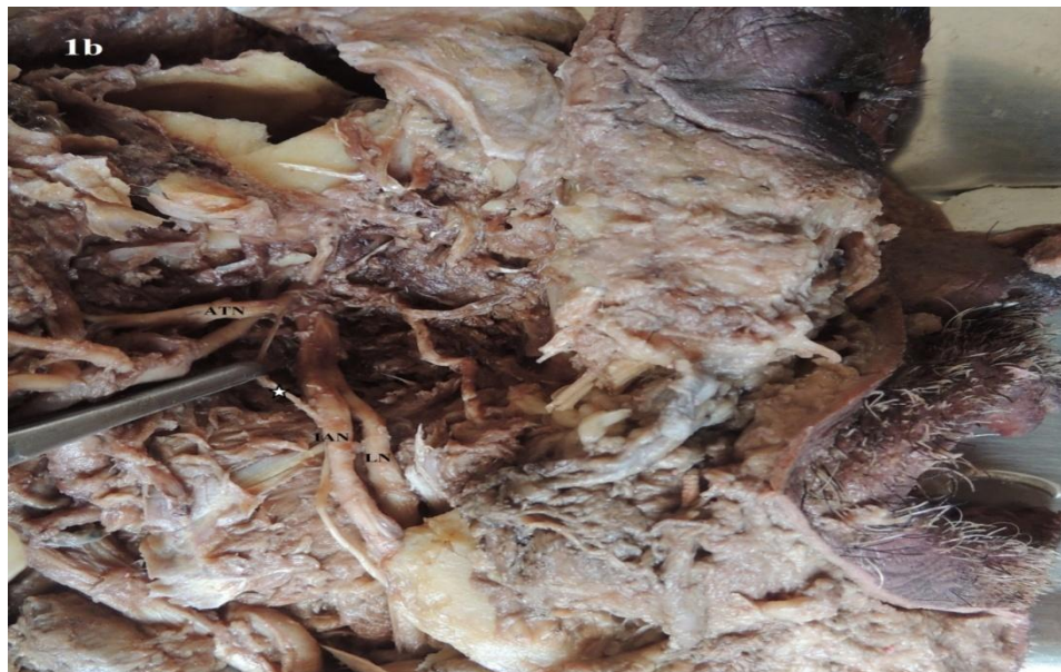
Fig 1b: Lateral view of the right infratemporal region showing a communicating branch (marked ☆) between the inferior alveolar nerve & auriculotemporal nerve. Both nerves are following its normal course. Mylohyoid nerve is arising from inferior alveolar nerve and it lies posterior to it.

Asterisks (☆) showing the communication between the two nerves.