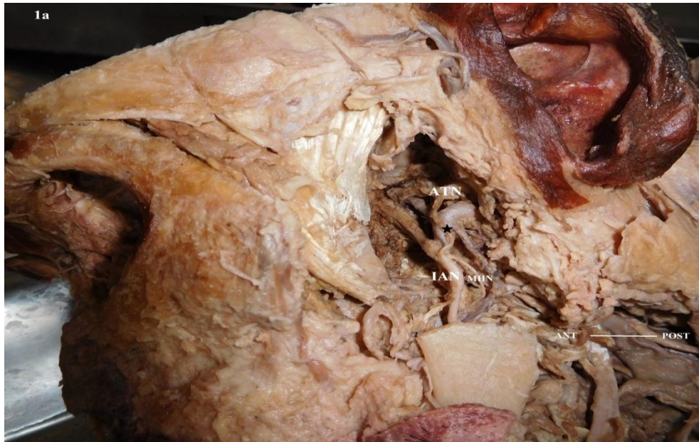
Fig 1a: Lateral view of the left infratemporal region showing a communicating branch (marked ☆) between the inferior alveolar nerve & auriculotemporal nerve. Both nerves are following its normal course.

ATN: Auriculotemporal nerve, IAN: Inferior alveolar nerve, MHN: Mylohyoid nerve.