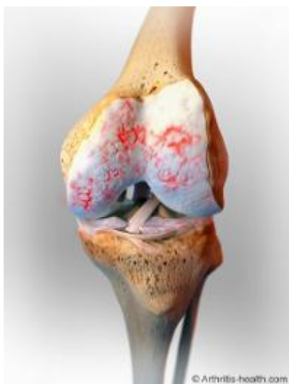
Figure 1: Knee Osteoarthritis

Knee pain. Pain is the most commonly reported symptom of knee osteoarthritis. The description of the pain will depend on the patient's condition and situation. For example, the pain may come and go or there may be a chronic low level of pain with intermittent flare-ups of more intense pain. The pain may be experienced as dull and aching or as sharp and intense, and it is usually worse with certain activities that place additional strain on the joint, such as when bending down or walking up stairs. Typically, the knee pain can be lessened with rest and an ice compress.