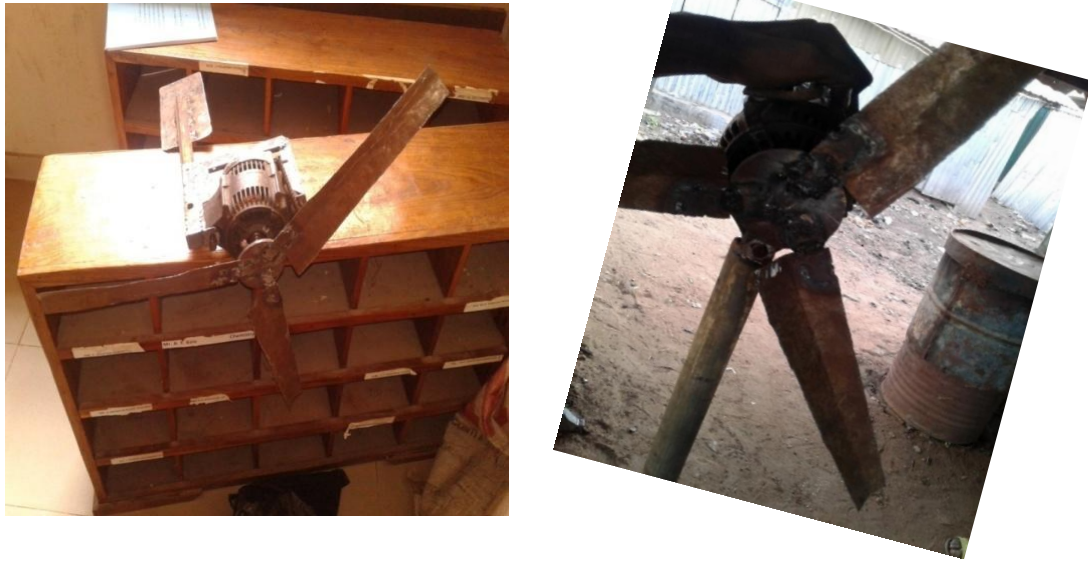
Figure 5: Coupled Alternator, Turbine, Frame and Galvanized Pole

Alternator connected to the blade with the tail was tighten with two 17 spanner size bolt & nut of 10 mm tap tread, which hold tight the alternator connected to the blade with the tail together with the galvanized steel pipe stand.