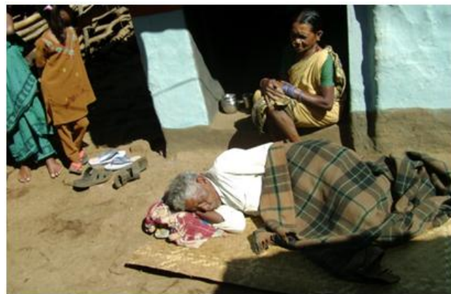
Fig 5: A Male patient suffering from malaria.