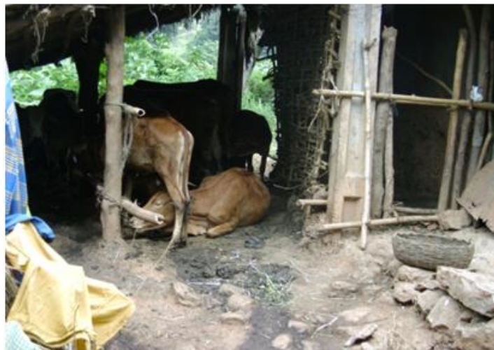
Fig. 1: A Cattle shed attached to house.