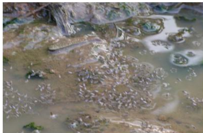
Fig. 2: Mosquitoes larvae and adults are in urinary pits of the cattle.