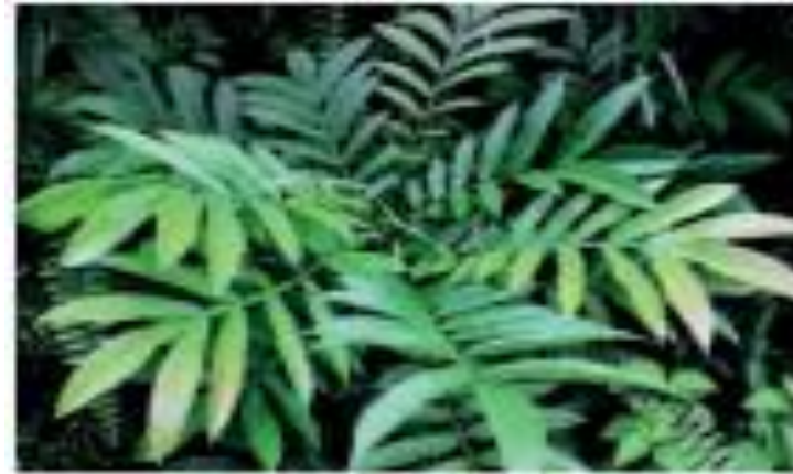
Figure no 1. Sungkai ( Peronema canescens )