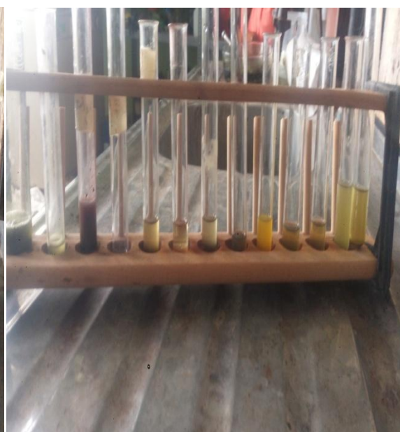
plate II. Phytochemical screening of K. africana