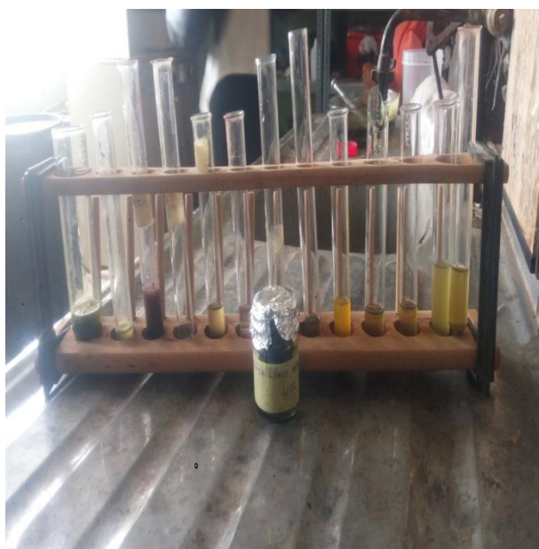
Plate I. phytochemical screening of T. indicam .

Key: SME=Stem bark methanol extract, SCE=Stem bark chloroform extract, LME=Leaf methanol extract, LCE=Leaf chloroform extract.