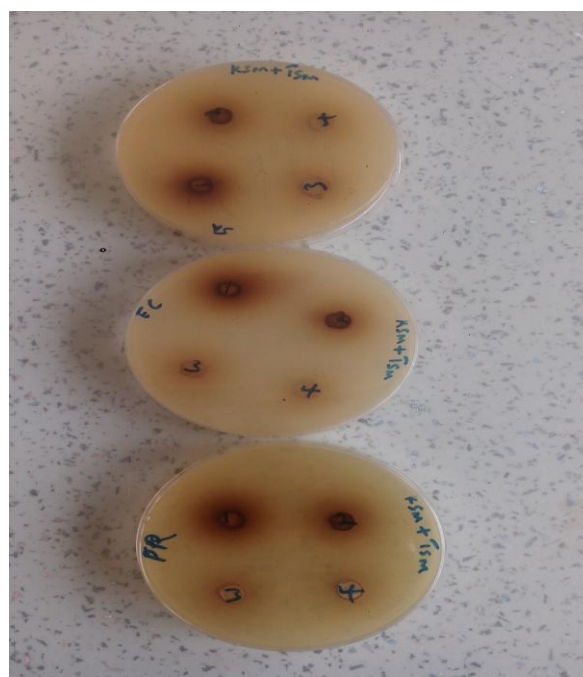
Plate. IV Antibacterial of T. indica