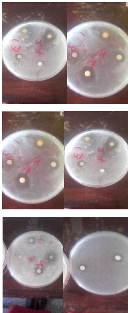
Figure 3.2 Antimicrobial activity of fruit and root extracts of Solanum incanum against gastrointestinal Staphylococcus aureus , Escherichia coli and Salmonella typhimurium . Different concentrations of methanol extracts of Solanum incanum roots and fruits were tested using disc diffusion system against three pathogens. Zones of inhibition of different concentrations of fruit extract (a) and root extract (b) on S. aureus , Zones of inhibition of different concentrations of fruit extract (c) and root extract (d) on E. coli , Zones of inhibition of different concentrations of fruit extract (e) and root extract (f) on S. typhimurium . Zones of inhibition of different Zones of inhibition of different concentrations of ciprofloxacin (g) and DMSO (h) on E. coli . The plates were divided into four quadrants each with a different concentration of the extracts or positive control. The concentrations were represented by numerals; 1-200mg/ml, 2- 100mg/ml 3- 50mg/ml 4-25mg/ml.

The S. incanum roots and fruits extracts showed antibacterial activity against E. coli , S. aureus and S. typhimurium determined using disc diffusion technique. The positive control (Ciprofloxacin) showed larger zones of inhibition compared to the roots and fruit extracts at all the concentrations. The values of the diameter of zones of inhibition are represented graphically as shown in fig 3.3.