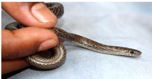
Fig.-1 Smooth snake lateral view