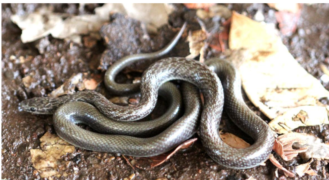
Fig.-3 Smooth snake in its natural habitat from Kolhapur district, Maharashtra State, India.