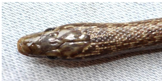
Fig.-2 Dorsal view of head