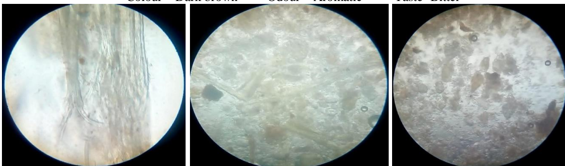
Fig 5 Medullary ray