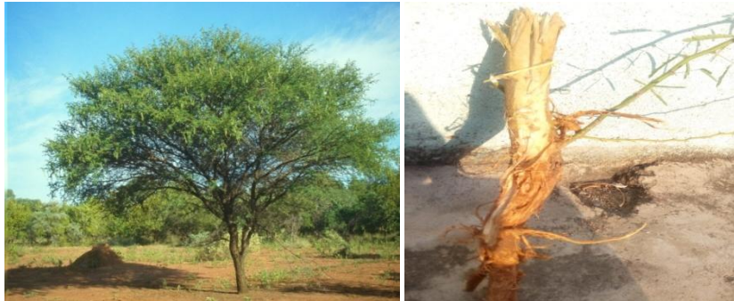
Figure 1 ACACIA NILOTICA

Root width - 12mm Root length - 50mm Size - Irregular