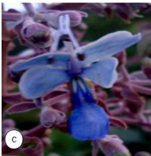
Fig.3. Individual Flower of Rothea