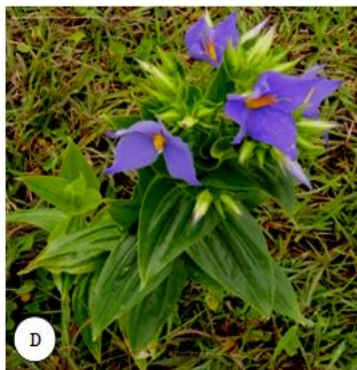
Fig.4. Whole plant of Exacum trinervium ssp. macranthum