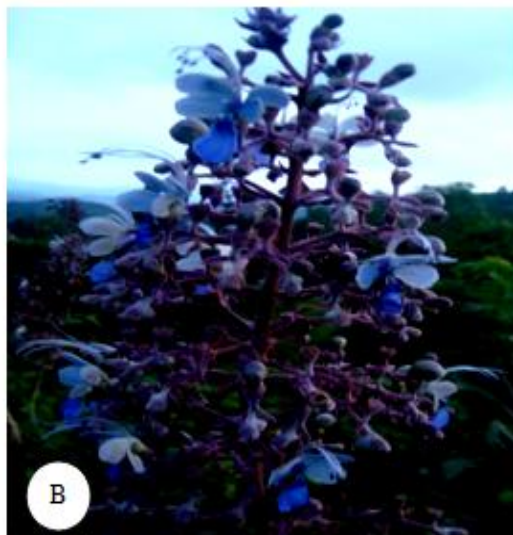
Fig.2. Inflorescence axis