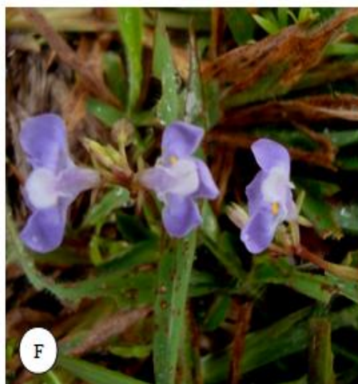
Fig 6. Whole plant of Utricularia graminifolia

Gouri Sankar Juga Prakash Jena. " Four New Flowering Plant Records From Koraput District of Odisha, India." IOSR Journal of Pharmacy and Biological Sciences (IOSR-JPBS) 13.4 (2018): 23-28.