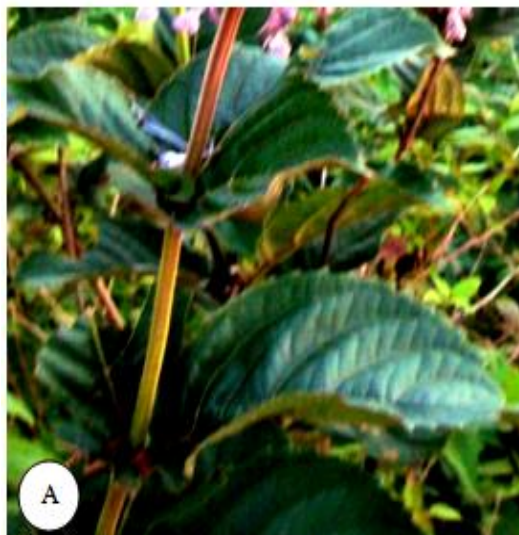
Fig.1. Base of the Rothea leaf clasp each other