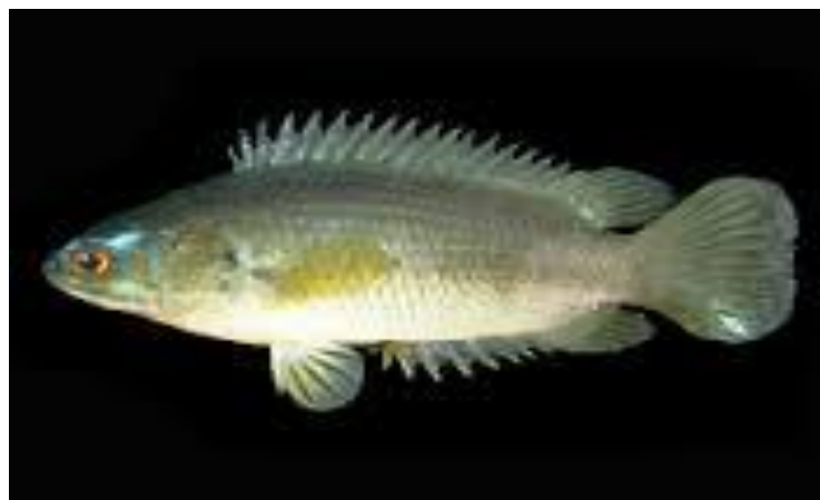
Plate 3: Anabas testudineus