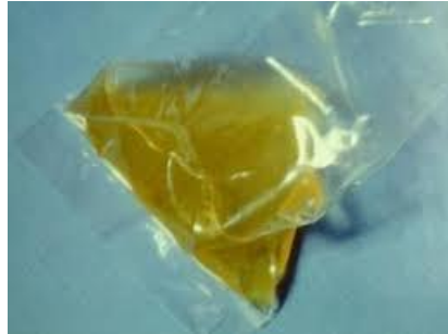
Fig 2:Urine like diarrhea

Amniocentesis reveals that there is an elevated bilirubin and alpha fetoprotein level. The ultrasonographic report shows that there is distended and large bowel loops for which it is often misdiagnosed as bowel atresia or intestinal occlusion and often go for unnecessary surgical intervention after birth