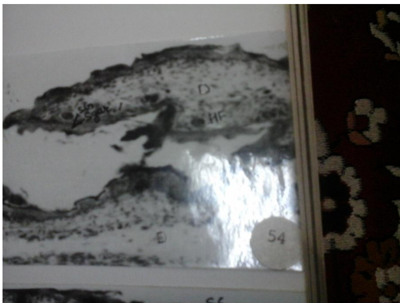
Image 1 Histological picture of skin of newly born mice treated with 4mg RA per pregnant female at 14 th day gestation showing disrupted outer layer and inhibited hair follicle.

distinct layer of cells. It consist of loosly arranged connective tissue fibers with occasionally hair follicles. In most hair follicles are absent, skin glands are not developed in these cases.