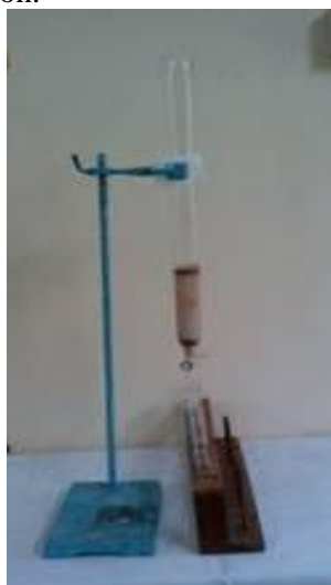
Figure 2: Column chromatography

In Column Chromatography, 100 micron particle size silica gel was used as stationary phase. Before starting the experiment first insert a piece of cotton into the column towards outlet. Fix the column to the clamp tightly. Pour the sea sand of 1cm bed in the column. Add silica gel powder in the column up to 20cm length from the neck of the column. Run the solvent methanol in the column up to the bed was entirely wet. Add excess solvent on the top of the silica gel bed. Gently tap the column with hand or soft materials. After tapping gentle pressure can be applied. Before loading the sample in the column, little silica gel was added to the extract. Pour the extract and rinse the wall. Add sand on the top of the sample. The entire system was shown in figure 1. After collecting the samples for every 5 minutes from the column, take 1ml of sample from each test tube add 0.5ml FD reagent and 1ml Na 2 CO 3 . Make up this solution up to 10ml with distilled water. After 30min read the absorbance at 700nm for chebulinic acid concentration.