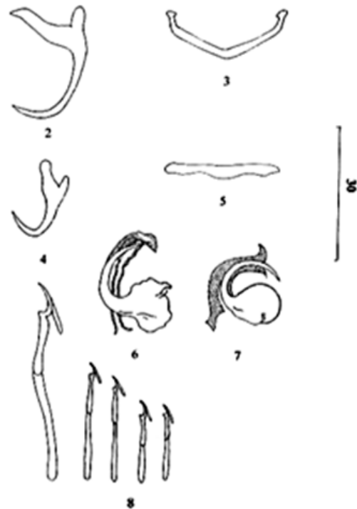
Figure 2-8: 2. Dorsal anchor; 3. Dorsal bar; 4. Ventral anchor; 5. Ventral bar; 6&7. Views of copulatory complex; 8. Hooks. Plate- 3B