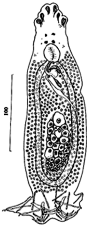
Fig. 1. Chandacleidus kheriensis n.sp. whole mount (Ventral view) Plate- 3A