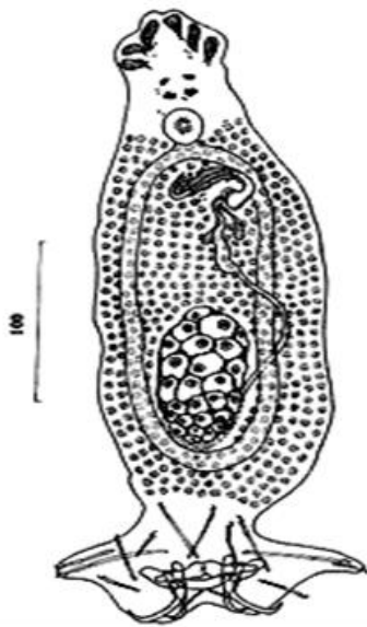
Fig.1 Chandacleidus palliaensis n. sp. Whole mount (Ventral view) Plate-2A