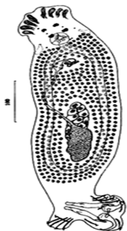
Fig.1. Spicocleidus brevianchoratus n.sp. whole mount (dorsal view) Plate- 1A