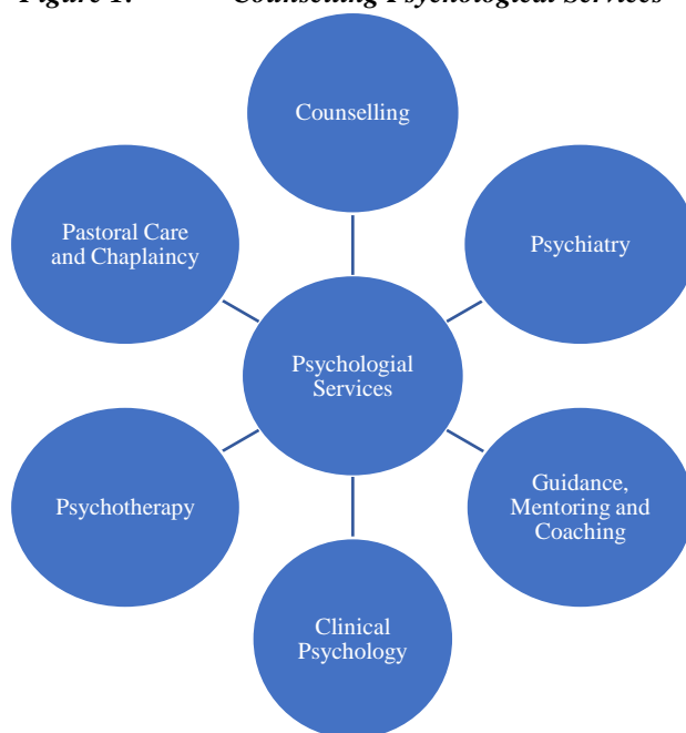
Figure 1: Counselling Psychological Services

The main types of counselling and psychological therapies widely used include Clinical Psychology; Counselling; Guidance, Mentoring and Coaching; Pastoral Counselling and Chaplaincy; Psychiatry; and Psychotherapy. The range of brand names is different as it depends largely on the help provided, and the specialist or institution. Individuals and institutions apply diverse approaches in different settings according to the designated principles (Wango, 2017b; 2017c). Besides, nursing and social work may include some therapy. The role of psychotherapy as an intervention should be highlighted.