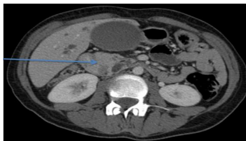
Figure 1: Scannographic axial sections showing a tissue process centred on the bulb of Vater enhanced after contrast, bending in the duodenal lumen with thickening of the internal wall of D1, it measures 35x27 mm

A 28-year-old woman presented 4 months before admission with a generalized asthenia associated with cholestatic jaundice, abdominal CT showed a tissue lesional process of the vater bulb protruding into the duodenal lumen with thickening of the inner wall of the D1, it measures 35x27 mm (Fig. 1). Histopathologic examination of the biopsy in favor of an interstitial duodenitis with calcification. A pancreaticoduodenectomy was performed (Fig. 3), the anatomopathological and immunohistochemical examination of the surgical specimen was in favor of a well differentiated neuroendocrine tumor of 2.7 cm with expression of synaptophysin, chromogranin A and CKAE1/AE3 with a Ki 67 at 3% (Figs 4 and 5). one of the twenty examined ganglions was involved. An abdominal computed tomography of control was performed 3 months later, which showed an infiltration of the operating area without mass or visible pathological contrast enhancement (Fig. 2). She remained disease free 19 months after surgery.