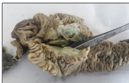
Figure 3: Macroscopic appearance of the CDP patch with a beige nodular ampullary tumor (forceps).