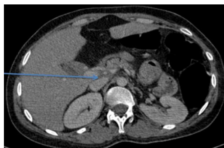
Figure 2: Scannographic axial sections showed an infiltration of the operating area without mass or visible pathological contrast enhancement