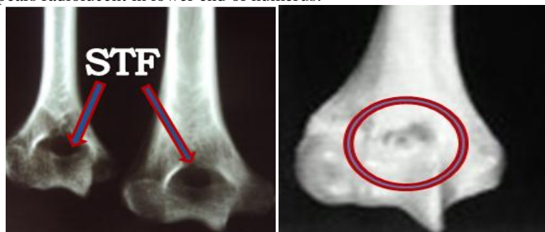
Radiograph of humerus with STF

Radiographs are taken for the humerus with supratrochlear foramen and humerus without the foramen. The area of STF appears radiolucent in lower end of humerus.