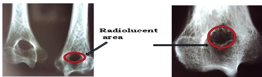
Showing the radiolucency of STF