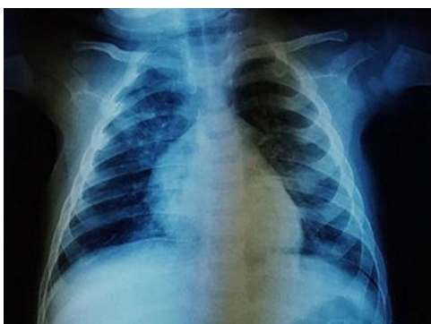
Figure 1: Chest X-ray with interstitial infiltrates on the right superior lobe

ground glass opacities which suggest the COVID origin, a left mild sized pneumothorax and a pneumomediastinum (Figure 2). The subcutaneous emphysema was extended causing face swelling and disappearance of body reliefs such as sub-clavicular area. There is no indication of chest drainage. The evolution was favorable marked by a progressive amelioration of his subcutaneous emphysema and the child was discharged in good general condition and a normal chest X ray.