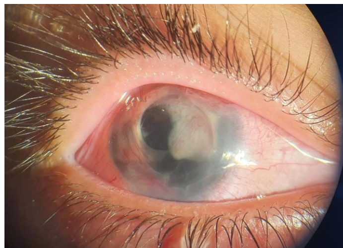
figure :Slit lamp photograph of the right eye showing epithelial downgrowth and demonstrating a neovascular membrane