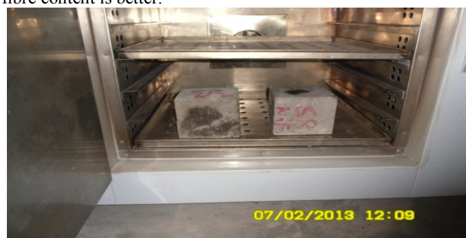
Fig. 4 After heating at 300°C for 2 hours

The normal as well as fibre reinforced concrete cubes were exposed to elevated temperature of 300°C for two hours as shown in Fig. 4. Afterwards, they were tested to determine their residual strength. The results are shown in Table 2. There is a reduction of about 32 per cent in strength of normal concrete after fire. There is a reduction of 20 per cent in strength of 0.5 per cent fibre reinforced concrete over that of its original strength. Corresponding value in the case of 1.0 per cent fibre addition the reduction in strength was 10 per cent. It is quite clear that with higher percentage of fibre addition, there is a lesser degradation in strength. The fire rating of concrete with higher fibre content is better.