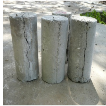
a) Conventional concrete Fractured into two pieces (b) Specimen reinforced with fibre Fig. 2 Crack pattern of cylinder

Figure 3 shows the failure pattern of prisms. Figure 3(a) shows a failure pattern of normal concrete prism whereas Fig. 3(b) that of fibre reinforced concrete. The normal concrete prism was fractured near centre whereas fibre reinforced concrete prism fractured on the left one-third portion.