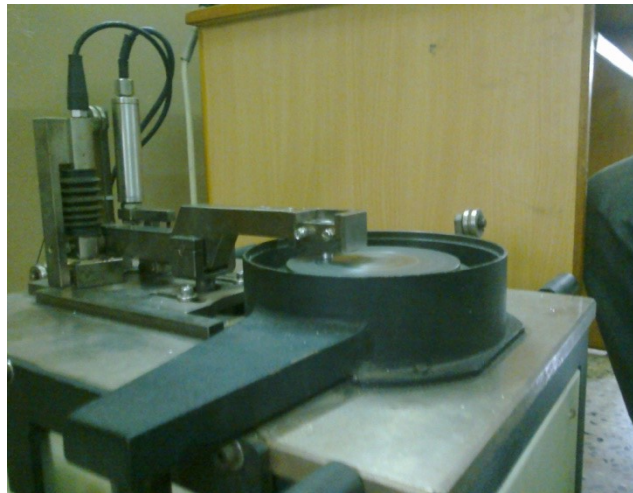
Fig.3 shows pin-on-disc wear testing machine

Fig.2 shows the microstructure viewed by optical microscope for different weight fraction of Hybrid Composites (LM6/SiC/Fly Ash)