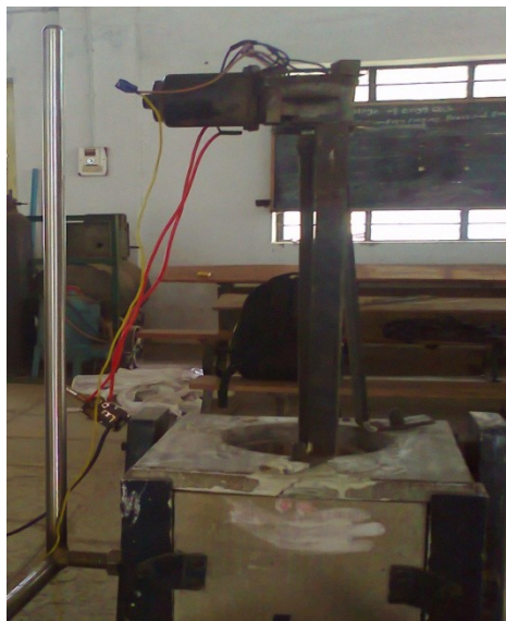
Fig.1 shows stir casting setup