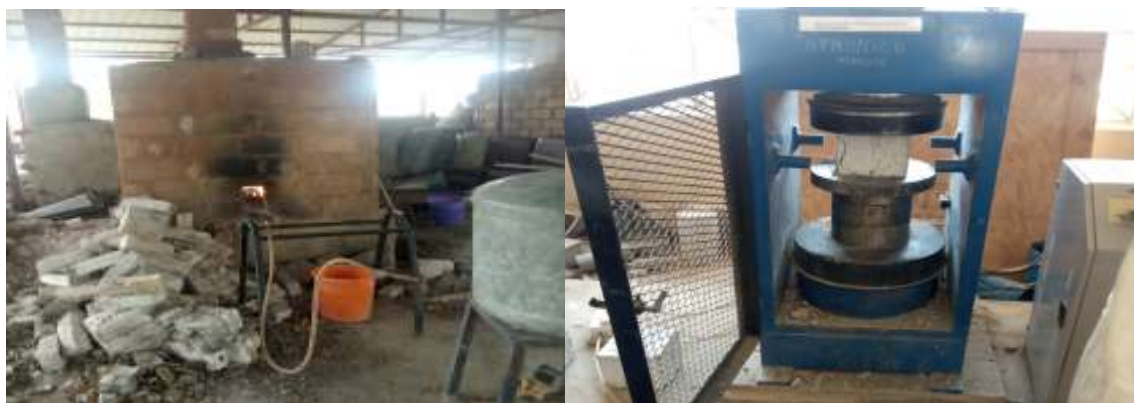
Plate 5.0 Kiln used for firing of cubes. Plate 6.0 Crushing machine with crushed cube.

The test cubes was fired using kiln, with fire sourced from kerosene burner, of Abubakar Tafawa Balewa University Bauchi (ATBU), Industrial Design Department and also crushed in ATBU Structural Laboratory, Civil Engineering Department.