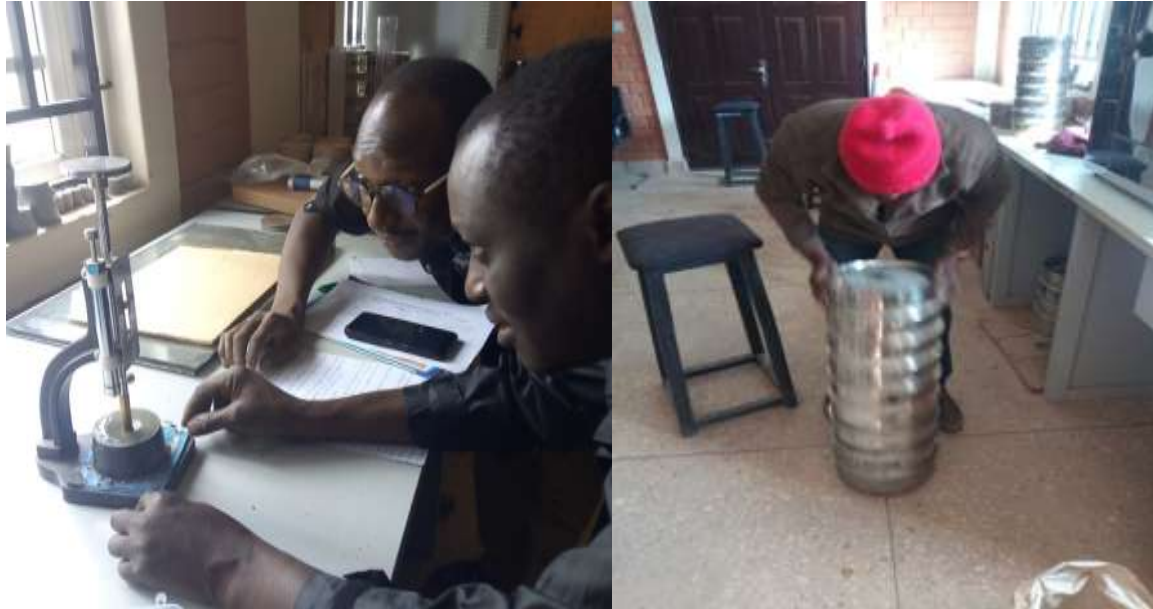
Plate 1.0 Determination of setting time and consistency of cement using Vicat Apparatus Plate 2. Aggregate sieve analysis using manual method