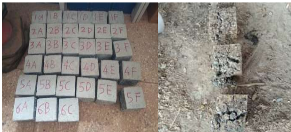
Plate 3.0 Produced concrete cube specimens before firing. Plate 4.0 Melted component of cube specimen

Mix ratio of 1:2:4 and 0.55 water cement ratio (w/c) was used for the production of the test concrete cubes. Twenty-four concrete specimens were produced with three specimens for each time of 0, 1, 2, 3, 4, 5, 6, and 7 hours respectively. The test concrete cubes was produced by mixing the required weight of cement, aggregate and water, after which it was poured into an oiled mould of size 150mmx150mmx150mm and compacted in three layers of 50mm each by rammering using steel rod. The test cubes were demoulded after 24 hours, weight and immersed in a curing tank filled with water for 28days at room temperature. After 28 days the test cubes were removed, weight and air dried. Test cubes were made from fresh concrete in compliance with BS 1881-108:1983.