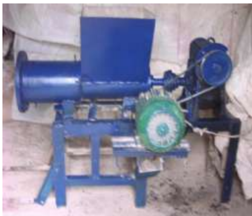
Fig 1: A picture of the experimental cassava pelletizer

hopper, heat exchanger barrel, reduction gear and the frame. Each component was designed following standard engineering principle [8].