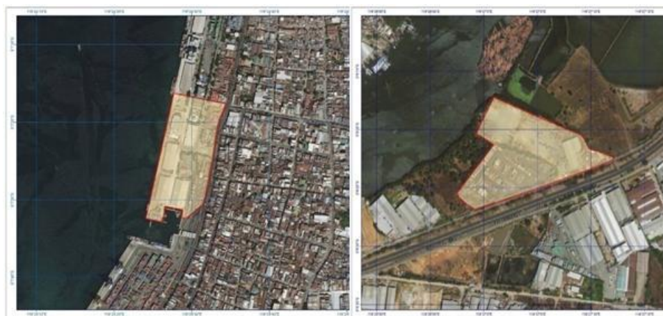
Figure 1. Location of Makassar Container Terminal and Meratus Sutami Depot

This research is classified as qualitative and quantitative descriptive, direct observation is carried out at Container ports in Makassar, Container Terminal Depo Meratus on Ir. Sutami road Parangloe warehouse in Makassar Industrial area. Comparative analysis is carried out by comparing the average performance values and container growth trends in the last 4 years according to port operational data from the Port Authority, terminal managers and container depots.