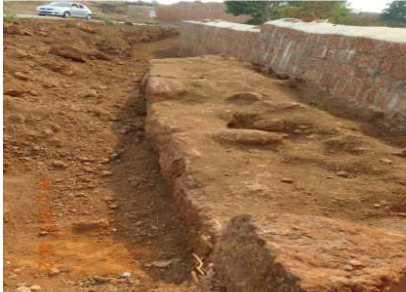
Fig.No 2: Excavation of buried structure at Bhudargad fort