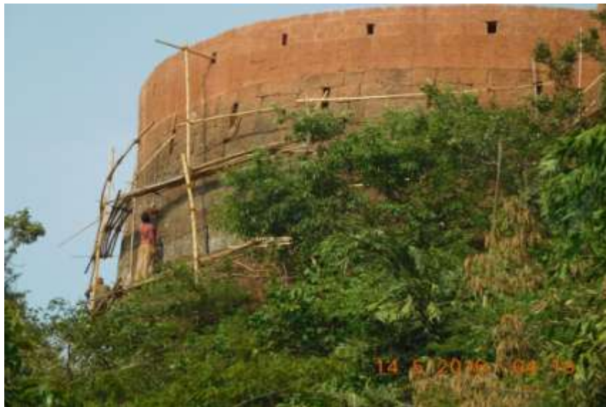
Fig. No.3: Construction of protection wall at Bhudargad fort