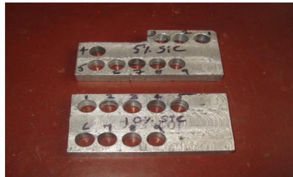
Fig. 5: Drilled Specimens.

In drilling operation quality of hole produced plays an important role. Getting required hole dimensions, roundness and also surface finish along the length of the hole are very important to industries. The present study comprised of finding out surface roughness after performing drilling on AlSiC MMC. To characterize the surface quality, surface roughness was used. Average surface roughness value ( R_a ) was taken as many industries uses the same for their study. Surface roughness value found out around the hole circumference with 0.8 mm cut off length by using SURFTEST SJ - 201. Direction of measuring surface roughness was perpendicular to the circumference of drilled holes. Surface roughness reading found out as the average of three circumferential readings.