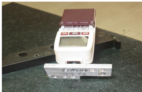
Fig. 6: Device for Measuring Surface Roughness.

In drilling operation quality of hole produced plays an important role. Getting required hole dimensions, roundness and also surface finish along the length of the hole are very important to industries. The present study comprised of finding out surface roughness after performing drilling on AlSiC MMC. To characterize the surface quality, surface roughness was used. Average surface roughness value ( R_a ) was taken as many industries uses the same for their study. Surface roughness value found out around the hole circumference with 0.8 mm cut off length by using SURFTEST SJ - 201. Direction of measuring surface roughness was perpendicular to the circumference of drilled holes. Surface roughness reading found out as the average of three circumferential readings.