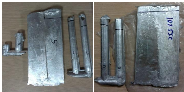
Fig.3: Prepared Composites.