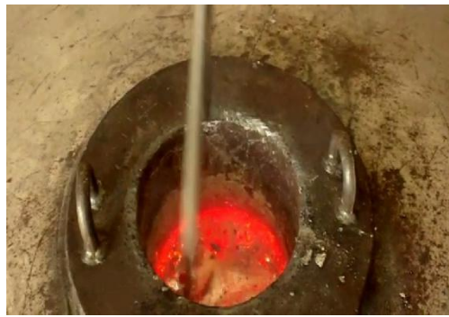
Fig. 2: Vortex Formation of Melt.