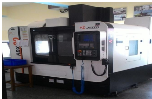
Fig. 4: CNC Vertical Machining Center.

Drilling test was carried out on prepared composites to know about the machining characterization of AlSiC MMCs. For drilling of composites, a specimen from each composite prepared according to required dimensions of 100mm × 50mm × 12mm. Samples were prepared by using vertical milling machine. Kerosene used as coolant. High Speed Steel (HSS) of 11mm diameter used as a drill tool material. Drilling carried out for various drill speeds (1000 RPM, 2000 RPM, 3000 RPM), feed rates (0.05 mm/rev, 0.10 mm/rev, 0.15 mm/rev) and various depths of cut (1 mm, 1.5mm, 2mm). Experiment was carried on CNC vertical machining center. Synthetic 68 used as coolant during drilling operation.