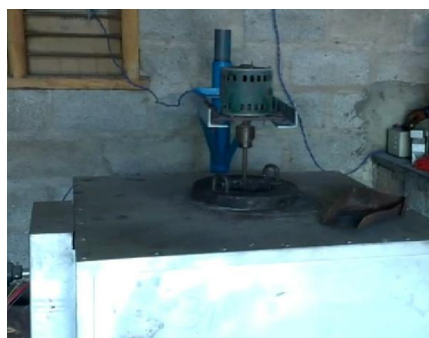
Fig.1: Stir Casting Setup.