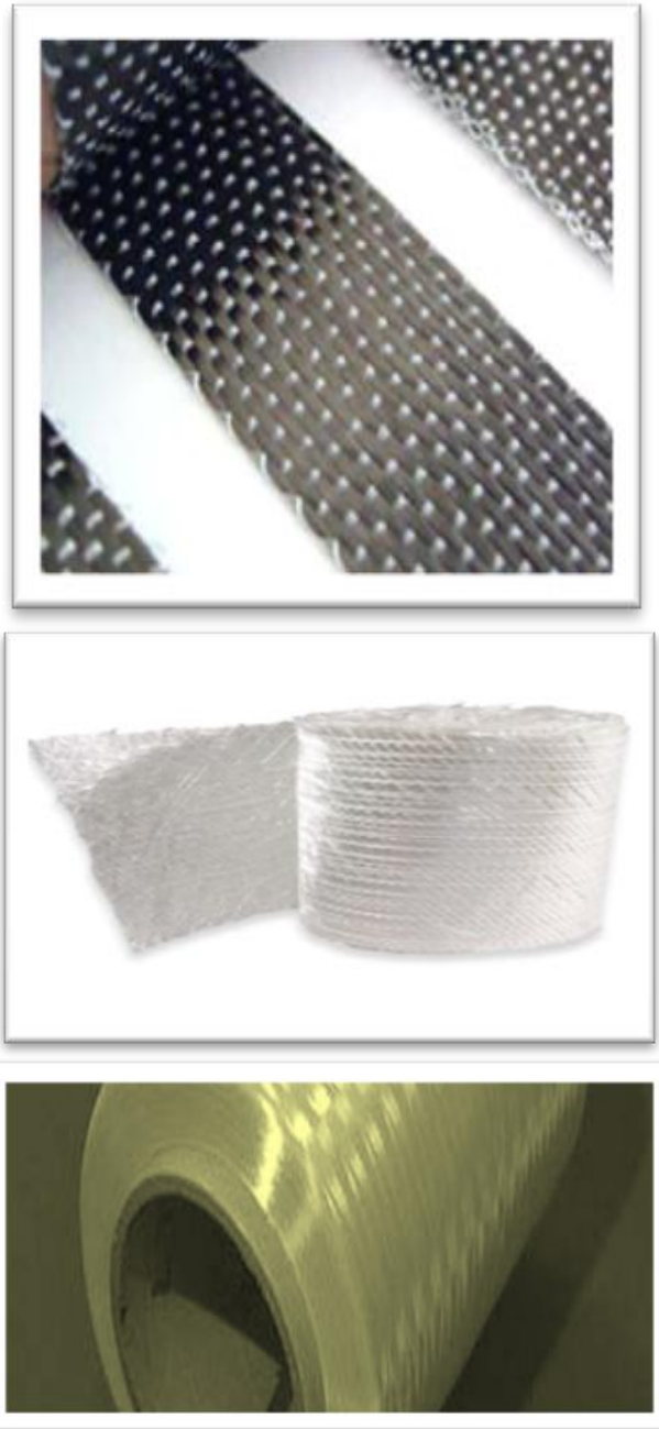
Fig 3. a) Typical Carbon fibers(CFRP) b) Typical Glass fibers (GFRP) c) Typical Aramid fibers (AFRP)

glass fibers are : high strength, low cost, good water resistance and resistance to chemicals. Aramid Fibers (AFRP) : Aramid fibers widespread known as a kevlar fiber in the markets .The structure of aramid fiber is anisotropic in nature and usually are yellow in colours. Aramid fibers more expensive than glass, moderate stiffness, good in tension applications (Cables and tendons) but lower strength in compression, Aramids have high tensile strength, high stiffness. high modulus and low weigh and density .Impact-resistant structures can be produced from aramids.