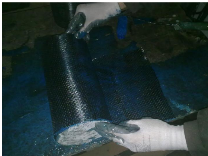
Fig.4. Application of FRP on concrete section for seismic retrofitting

Epoxy resins are used for small injection, surface coating or filling larger cracks or holes. If it is suitably applied, these materials could be bonded easily to concrete and are able to restoring the original structural strength to cracked concrete. The epoxy mixture strength is depend on the temperature of curing, lower strength for higher temperature and method of application. Viscosity must be suitable to the thickness of the crack to be injected. Cracks to be injected with epoxy resins should be between \sim 0.1 mm and \sim 6 mm in width. It is very difficult to retain injected epoxy resin in cracks greater than \sim 0.6 mm in width, although high viscosity epoxies have been used with some success. Epoxy resins cure to form relatively brittle materials with bond strengths exceeding the shear or tensile strength of the concrete.