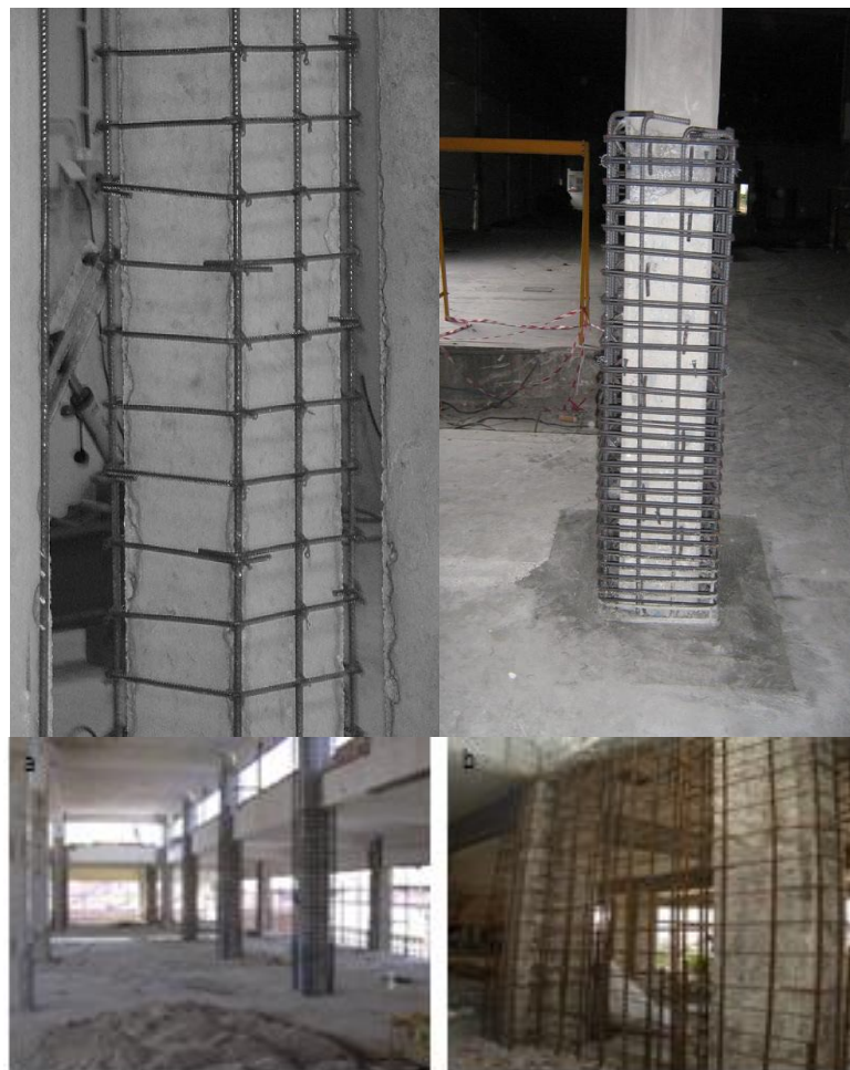
Fig.1. Typical concrete jacketing of reinforce concrete columns

This method application is difficult to construct in some active buildings such as hospitals, schools, industry etc. because of the implementation is taken time, made noise and many other limitations. In most cases Size of the columns or reinforced concrete members increased by concrete jacketing. Reinforced concrete jackets are build by enlarging the existing cross section with a new layer of concrete and reinforcement Fig 1 show that the enlargement of concrete and reinforcement [15].