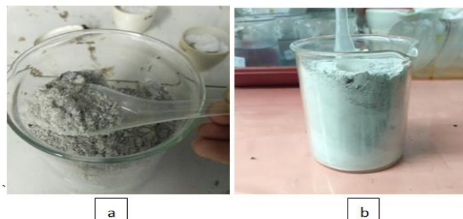
Figure 4. 1. Organic Waste Ash (a) and Shell Ash (b)

The preparation of garbage dust in this research was done using furnace at 700 0 C with 3 hours time. In this process we get gray garbage dust. The garbage dust in this study are used as a provider of CaO as the main ingredient in the manufacture of cement and other additives such as SiO 2 .