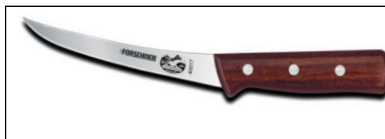
Fig. No.2. Boning Knife

D. Marsot J, Claudon L: In the late 20 th Century it's been found that the number of musculoskeletal injuries are increased in many industrialized countries and more specifically in companies require the continuous uses of hand tools.