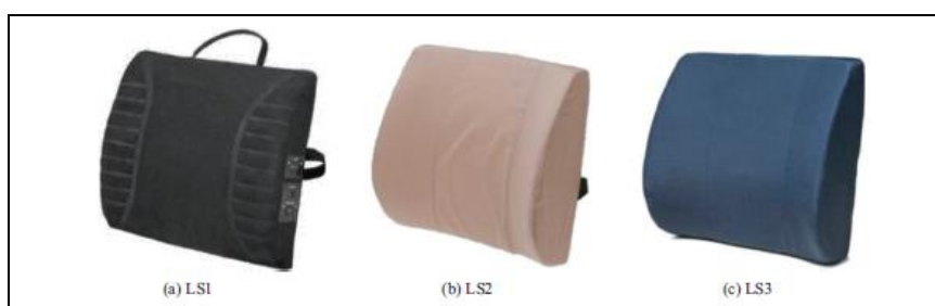
Fig. No.4. The lumbar backrest support condition used three commercially available lumbar support types: (a) black cushion, convex type, soft foam support LS1, (b) tan cushion, concave type, hard foam, support LS2, and (c) blue cushion, concave type, soft foam, support LS3.

It's been concluded by the author, all lumbar supports used while carrying out this studies have shown that it reduces the head motion and reduced discomfort and effectively reduced whole body vibration. Moreover, the lumbar supports are more comfortable for lower head motion and lower discomfort as compared with flat backrest. Also the ergonomic design of lumbar support helps in maintaining the natural shape of the lumbar spine during operations and would help operators to carry out daily work in a pleasant way.