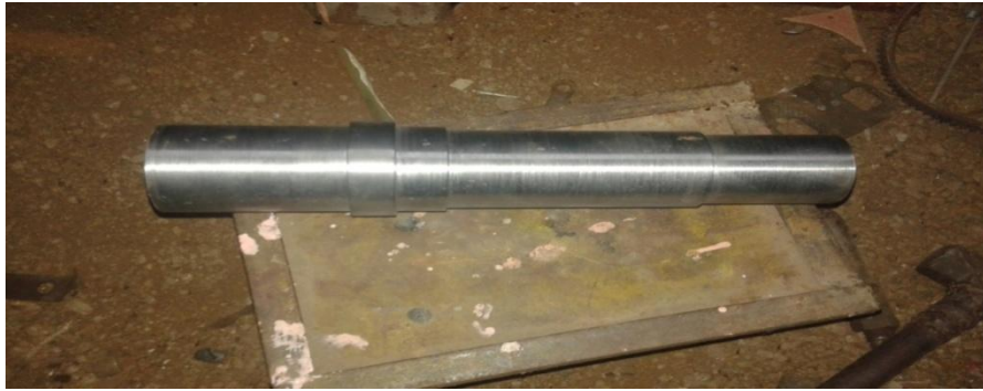
Fig. 2. Testing spindle specimen as per drawing