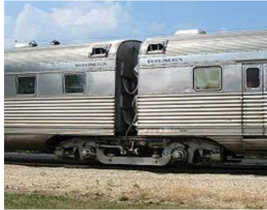
Fig 3:- An articulated bogie of a German ICE