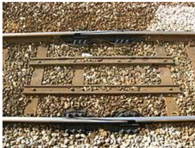
Fig 1:- A typical tapered expansion joint used in the French TGV.

Most modern railways use continuous welded rail (CWR), sometimes referred to as ribbon rails [3]. In this form of track, the rails are welded together by utilising flash butt welding to form one continuous rail that may be several kilometres long. Because there are few joints, this form of track is very strong, gives a smooth ride, and needs less maintenance; trains can travel on it at higher speeds and with less friction. Welded rails are more expensive to lay than jointed tracks, but have much lower maintenance costs. If not restrained, rails would lengthen in hot weather and shrink in cold weather. To provide this restraint, the rail is prevented from moving in relation to the sleeper by use of clips or anchors. Joints are used in continuous welded rail when necessary, usually for signal circuit gaps. Instead of a joint that passes straight across the rail, the two rail ends are sometimes cut at an angle to give a smoother transition. In extreme cases, such as at the end of long bridges, a breather switch (referred to in North America and Britain as an expansion joint) gives a smooth path for the wheels while allowing the end of one rail to expand relative to the next rail. However the Conventional Indian system is still using “fish plates” that may prove very weak for such high speed. They also make ‘clip-clap’ sounds when the wheel rim passes over them. All the four countries Japan, France ,Germany and S.Korea use continuously welded rail tracks with expansion joints.