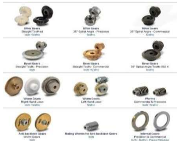
Fig: 3- Different types of gear assemblies

In the mechanical solar sun tracking system gear assembly act as a main component as it regulate the rotation provided by DC motor and enhances the torque at the same time.