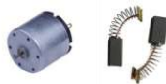
Fig: 2- DC motor and carbon brush.