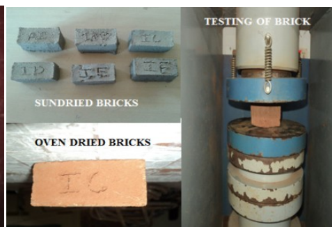
Fig.2 Drying & Testing of bricks

The bricks were casted by the soft mud method. The raw materials, red soil, clay, fine sand and waste materials were collected in a tray in the required amounts. They were mixed, as per the given proportion. Clay was mixed with water to form the finished product. The amount of water to be added depends on the nature of the clays and their plasticity. This water is removed during drying and firing. The mix is placed in the aluminium mould to form the size unit desired. To keep the clay from sticking, the moulds were lubricated with grease; after they are filled, excess clay is struck from the top of the mould. After the bricks are formed, they were sun dried to remove the free water. Bricks were fired and cooled in a muffle furnace, an oven-type chamber at temperatures of 400 °C, 500 °C and 600 °C.