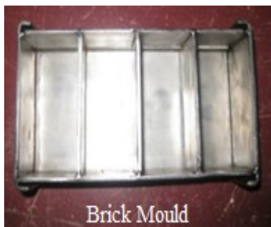
Fig.1 Aluminium Mould

An aluminium mould of size 7.5 x 3.3 x 3.3 cm was used to cast the bricks. The mould comprises of four compartments. The raw materials used for casting of bricks were, red soil, clay, fine sand and waste materials (fly ash and sludge). The sludge used for casting of bricks were collected from CSEZ, Kakkanad. The sludge contains ferric chloride, lime, cowdung and textile wastes which was obtained from waste water treatment plant.