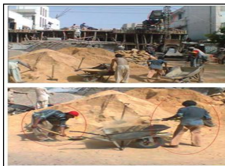
Fig. 1. Unsafe Working Environment (implemented procedures and lack of advanced equipments) [5]

Karachi is the capital economical hub of Pakistan, for getting employment, education and medical facilities peoples migrated all around the Pakistan to Karachi. Many of them getting employment related to construction work. Construction companies getting benefits of this unemployment ratio and hire cheap unskilled labor on daily wages to perform the job, this might cause to the increased number of site accidents [3]. Many contactors do have the safety policy, on paper but in practice there is no check and balance of safety constraint. Unemployed labor putting themselves in danger during execution of construction projects and learn from their own mistakes. Also construction equipments manufacturers have a responsibility to design and maintain safe products for use at the work site. This responsibility includes preventing the use of defective or unreasonably dangerous products, which include: scaffolding, power tools, cranes, woodworking tools, ladders, winches, trucks, tractors, bulldozers, forklifts etc [4]. When a construction site accident occurs, the owners, architects, insurance companies and manufacturers of equipment can be held responsible for inadequate safety provisions. For the detailed feature enhancement, the situation is clearly defined in the pictorial views as follows.