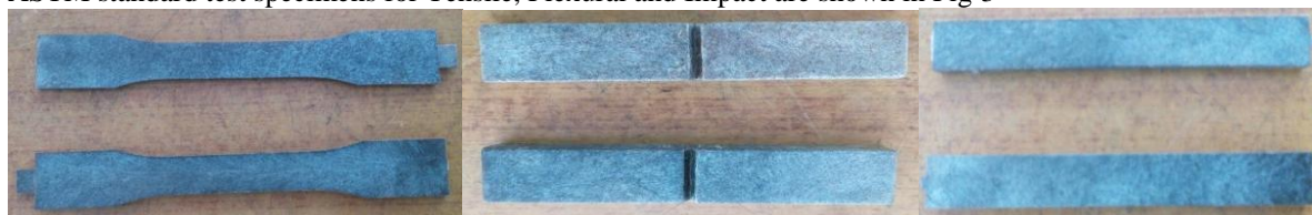
Fig 3 ASTM standard specimens

ASTM standard test specimens for Tensile, Flexural and Impact are shown in Fig 3