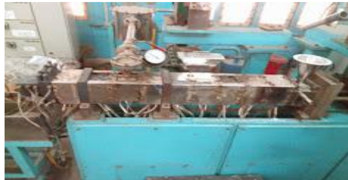
Fig 1 Experimental setup of twin screw extruder

The chopped banana fiber and high impact polystyrene are mixed by the rotation of screws present inside the extruder. The screw rpm are maintained at 60. The die has 3mm diameter hole through which the composite material is obtained in wire form. These material pass through pelletizer and made into small pellets. These pellets are put into injection molding to produce test specimen. The pictorial view of twin screw extruder is shown in Fig 1