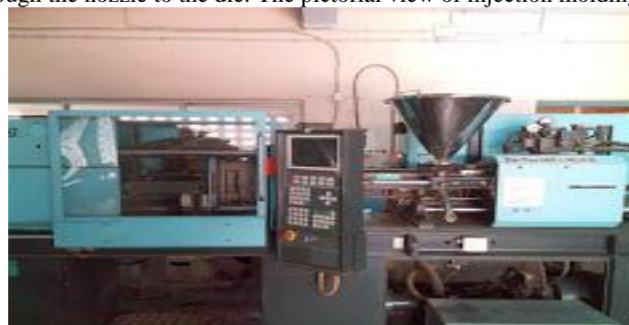
Fig 2 Experimental setup for Injection molding machine

Injection molding is used to make ASTM standard test specimens, where the pellets are put into the hopper and then it injected through the nozzle to the die. The pictorial view of injection molding is shown in the Fig 2