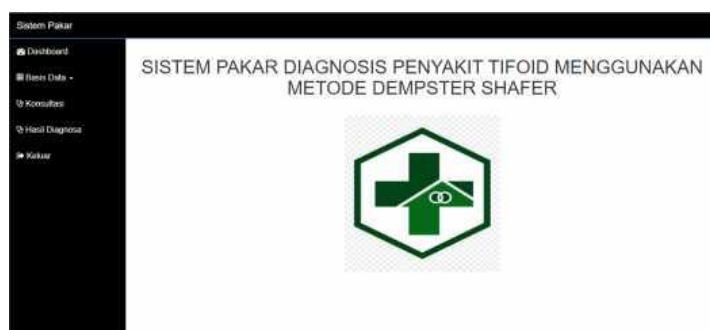
Figure 3 Admin Main Menu Page

In Figure 3 the main menu page contains six main menus, namely the homepage which when clicked will display the home page, the input menu which will display disease, the symptom and rule submenus, the diagnosis menu which will display the diagnosis page, the output menu which will display a submenu of the diagnosis report, the user , which will display the user page and the logout menu, which will return to the login page.