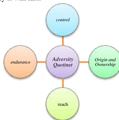
Figure 1. Dimensions Adversity Quotient

with CO_2RE is a dimension adversity quotient, namely control, origin, ownership, reach, and endurance. The fourth dimension the adversity quotient clearly explained by (Yanti & Syazali, 2016),that: (1) control (control), namely the level of perceived control over the events that give rise to trouble. Measurement indicators for students form controlself-student moment feel exists trouble; (2) origin (origin proposal) and ownership (acknowledgement). Measurement indicator origin form acknowledgement of origin suggestion exists a difficulty, while measurement indicator ownership form acknowledgement of the occurrence trouble; (3) reach, namely the extent of difficulty deemed reachable other parts of life. Measurement of the indicator from confession students will be towards the extent of a difficulty deemed reachable to other parts of life; and (4) endurance (power hold). Measurement the indicator from presumption students will be how long the difficulty will last and how long cause difficulty it will last.