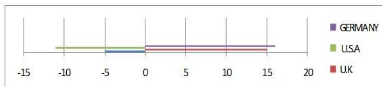
P.I.S.A-2006, a comparative graphic representation in science assessment