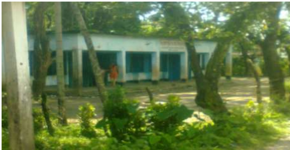
Pic: SangramPunji primary School.

Education is low among Khasi community where education of children rarely progresses past primary level. There are no secondary schools located nearby. The following picture showing a primary School of my study area at SangramPunji named SangramPunji primary School.