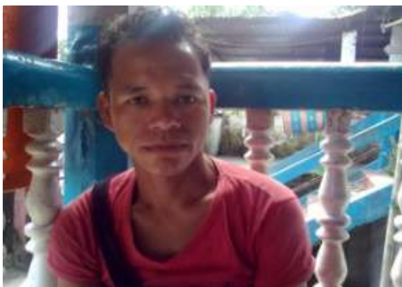
Tokas AKhasia young manHouse of Khasia