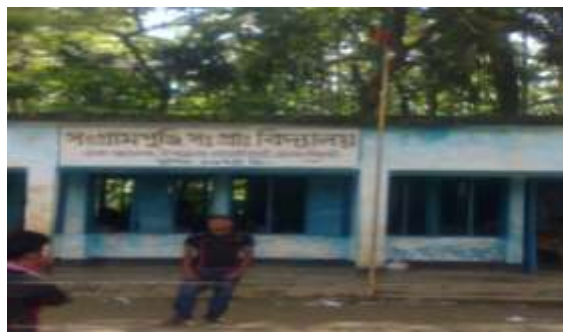
Primary School ofSangranPunji